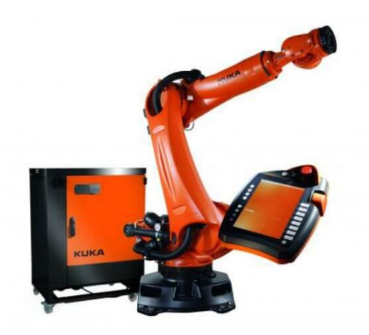
Figure1 Industrial Robot