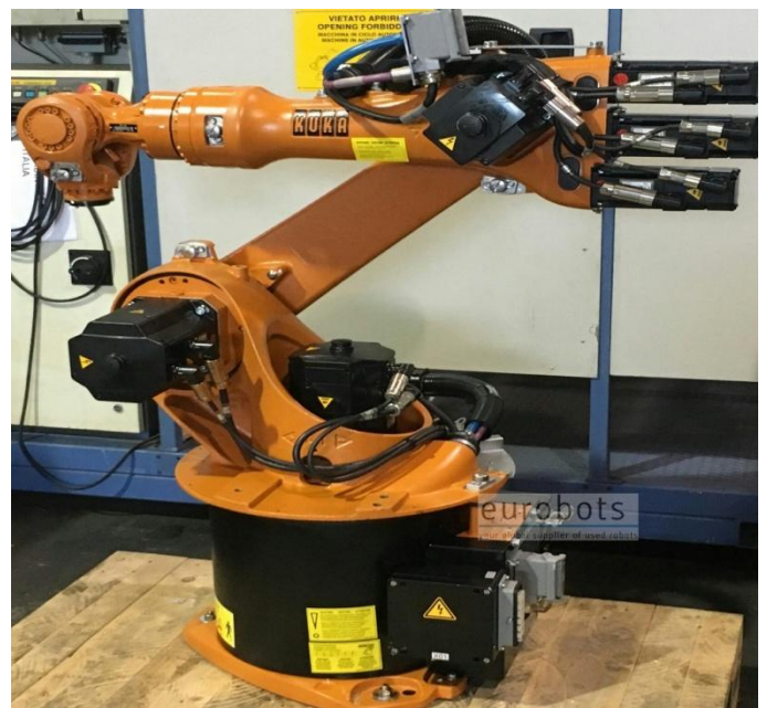
Figure 6 used KR 16

KUKA offers a comprehensive range of software. It gives maximum scope and maximum safety. It is very reliable which applications to simulation programs for planning robot cells and safe in robot technology. The advantage of this process gives high scope and maximum safety.